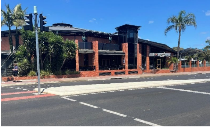
The view from across the road

The main entrance into the Arkaba is next to the carpark and opposite Frewville Foodland.